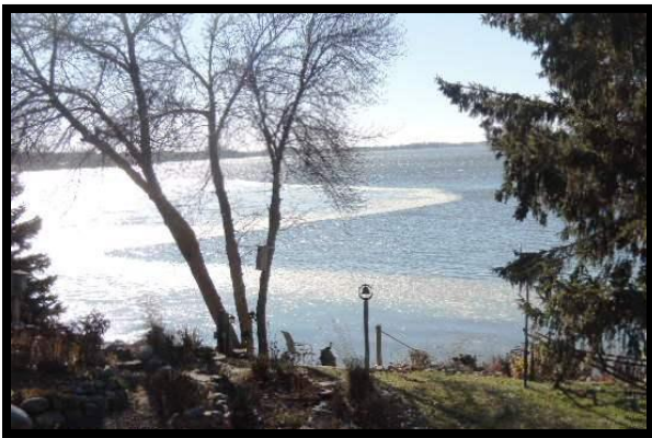
Above photo shows lake partially frozen on November 21 during the second thaw.

Daily December temperature (red line) showing that daytime temperatures reached 40 F during the middle of the month and then stayed below freezing after Dec 20. Yes, those temperatures on New Year's Eve are in the MINUS 20 F range!