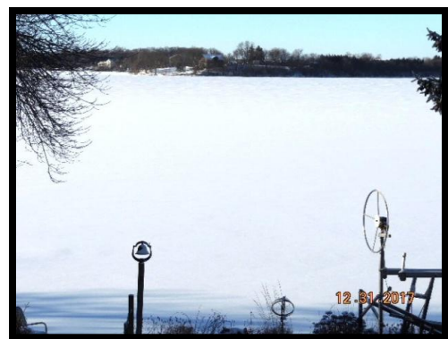
Right photo. Totally frozen and snow covered on New Year's Eve.