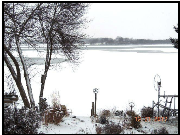
Above right shows lake fully frozen on December 21. What appears to be open water is actually frozen but not snow covered.