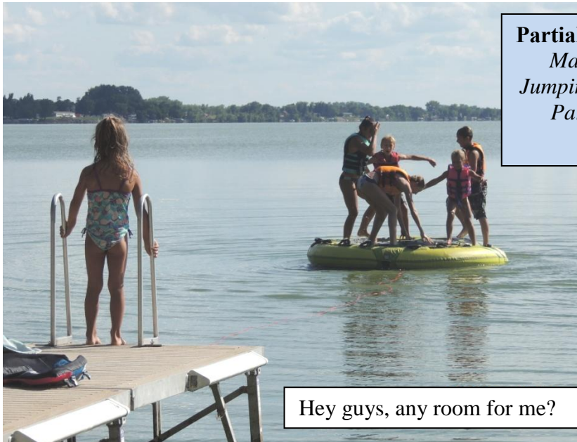
Hey guys, any room for me?

There's no signin' up, no monthly dues Take your Johnson, your Mercury or your Evinrude an' fire it up Meet us out at party cove Come on in' the waters fine Just idle on over an' toss us a line Bass-trackers, Bayliners and party barge Strung together like floating trailer park Anchored out and gettin' loud all summer long Side by side, there's five houseboat front porches Astroturf, lawn chairs and tiki torches Regular Joes rocking the boat, that's us The Redneck Yacht Club