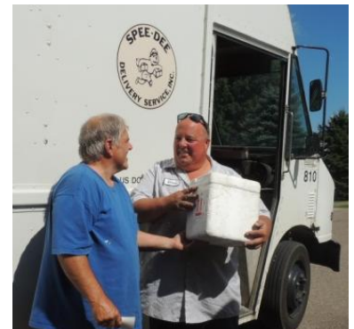
Mr. Speedy of Speedy Delivery Service picks up the water sample cooler from Club’s Water Watch Committee. The cooler was in Pierre the next morning for water analysis.

The Club’s Water Watch committee collected mid-lake samples that were sent to laboratories in Pierre for bacteria, algae and nutrient analysis (see photo).